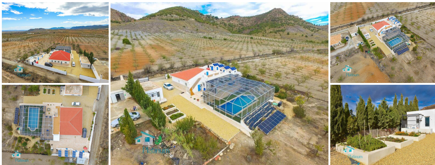
Dream Villa in Oria, Almeria: With Swimming Pool, Guest House and Panoramic Views

Villa of 219 m 2 constructed on a large plot of 2.500 m 2 for sale in the picturesque town of Oria, Almeria. The main house has 3 bedrooms and 3 bathrooms, perfect for a family or those looking for a spacious and comfortable living space. The living dining room is bright and spacious, with a modern open plan kitchen equipped with a central island, ideal for enjoying life with family or friends.