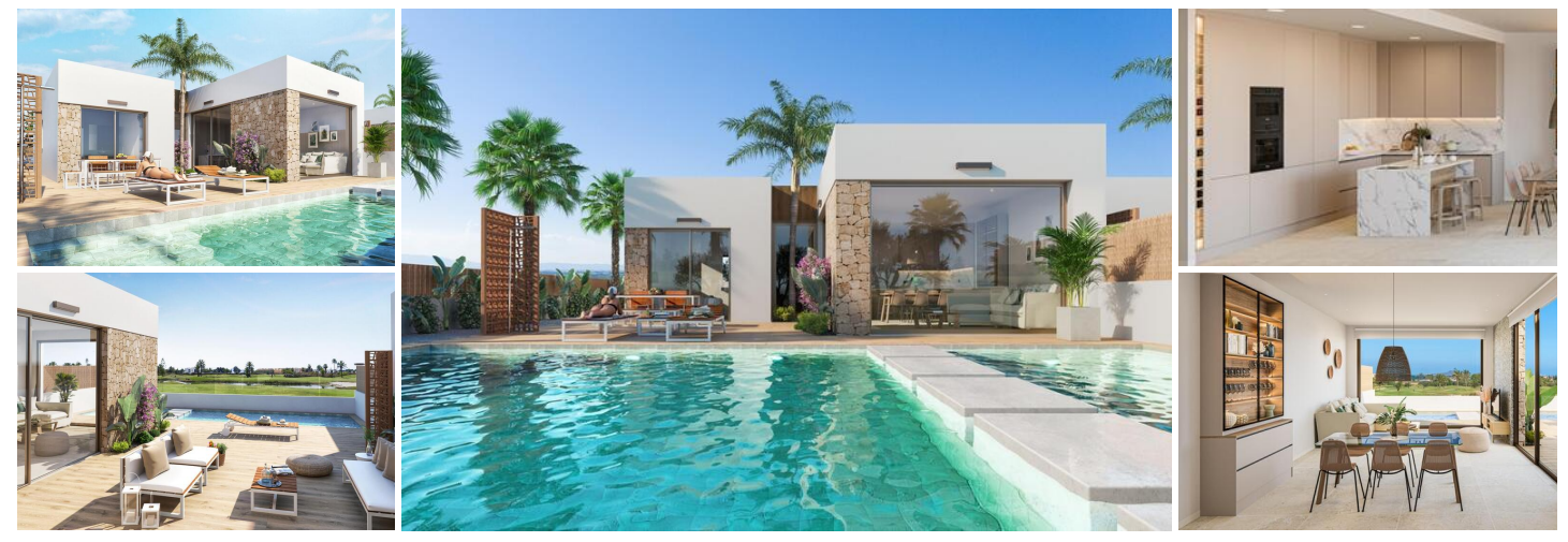
New Build Villas in Los Alcazares

Los Alcázares is an idyllic location for those looking to invest in a new residential property on the Costa Cálida. Just 25 minutes from Murcia Airport and approximately 55 minutes from Alicante Airport, this area is conveniently connected by highway to major cities like Cartagena, Murcia, and Alicante, as well as to other beautiful beaches along the Costa Cálida and Costa Blanca.