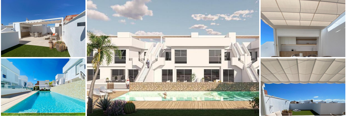
New Build Bungalow Residential Complex in Pilar de la Horadada