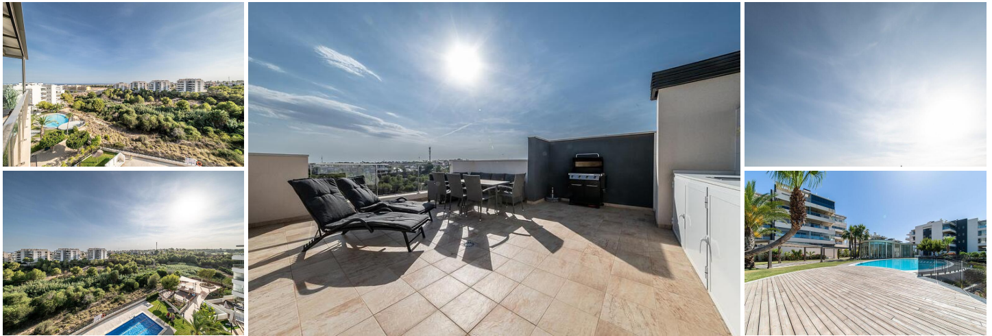
Modern Penthouse for Sale - Exclusive Spa Complex in Green Hills

Welcome to this elegant penthouse offering three spacious bedrooms with a total of 6 beds, two modern bathrooms, an open-plan living room and kitchen, a sunny balcony, and an impressive private rooftop terrace of about 50 m 2 . Perfect for sunny days and cozy evenings.