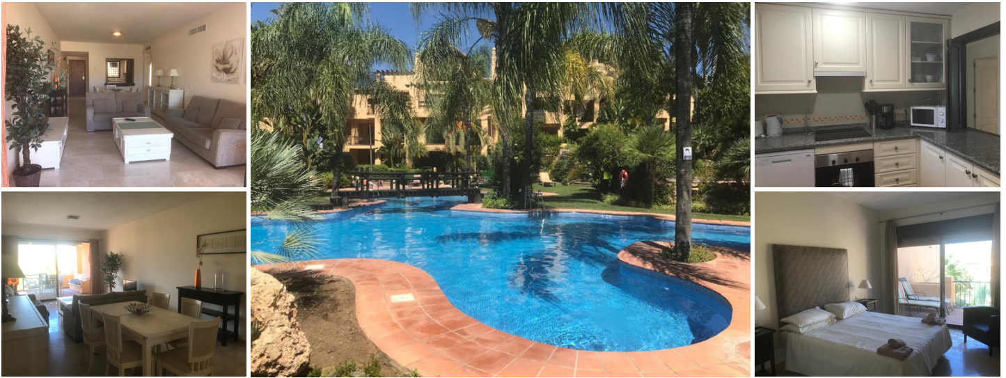
TOP FLOOR 2 BED 2 BATH APARTMENT, FOR LONG TERM RENTAL.

The apartment has a separate fully fitted kitchen with oven, hob, fridge freezer, dishwasher and microwave. The utility room houses the washing machine.