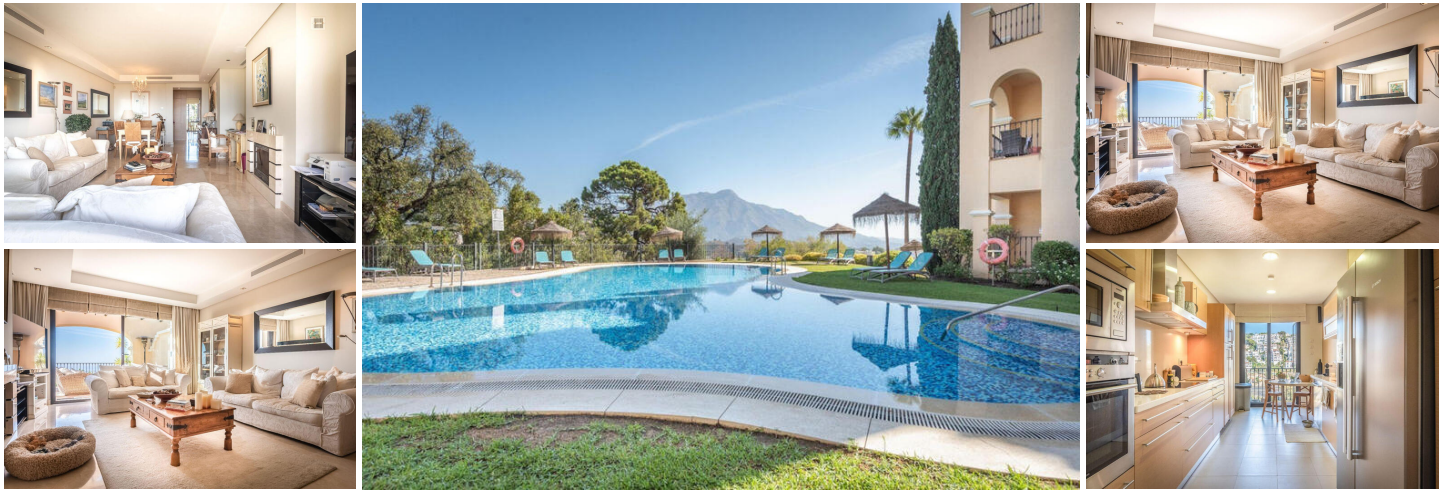
LA QUINTA ... PENTHOUSE

FREE Notary fees exclusively when you purchase a new property with MarBanus Estates