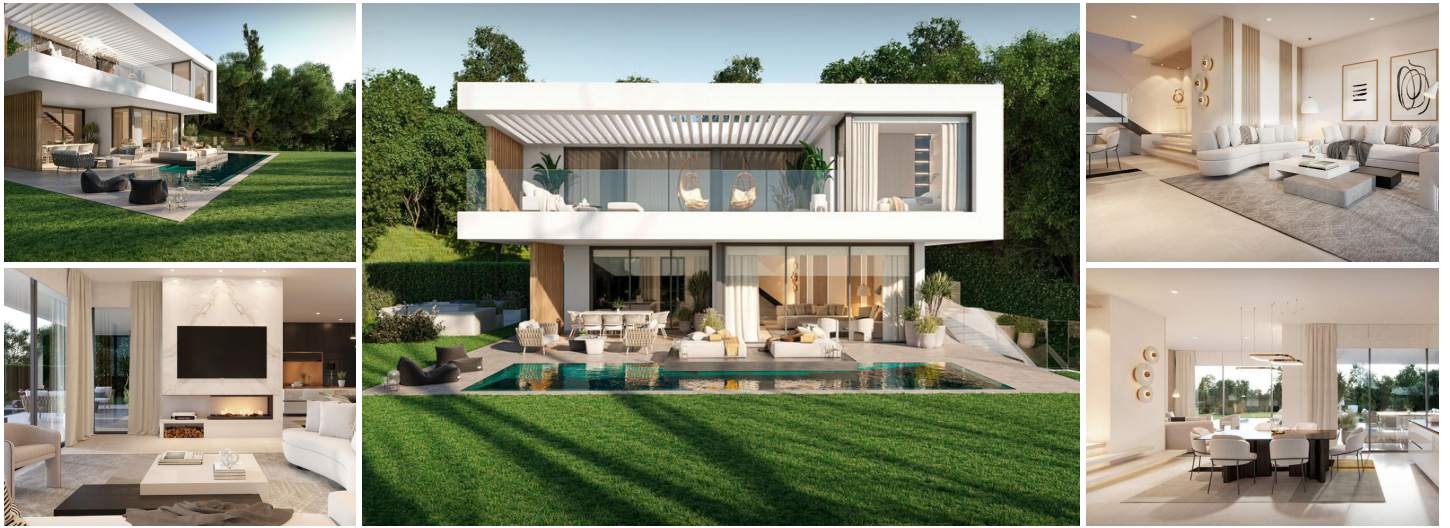
LUXURY NEW VILLA between Marbella and Estepona - New Golden Mile

Located at a convenient distance from the beach and close to all essential amenities including shops, schools (renowned Atlas American International School), and a children's playground, the villa presents a lifestyle of extraordinary quality and exclusivity. It is also just a short distance from the beach and golf courses, making it the perfect choice for those who enjoy a beachside lifestyle.