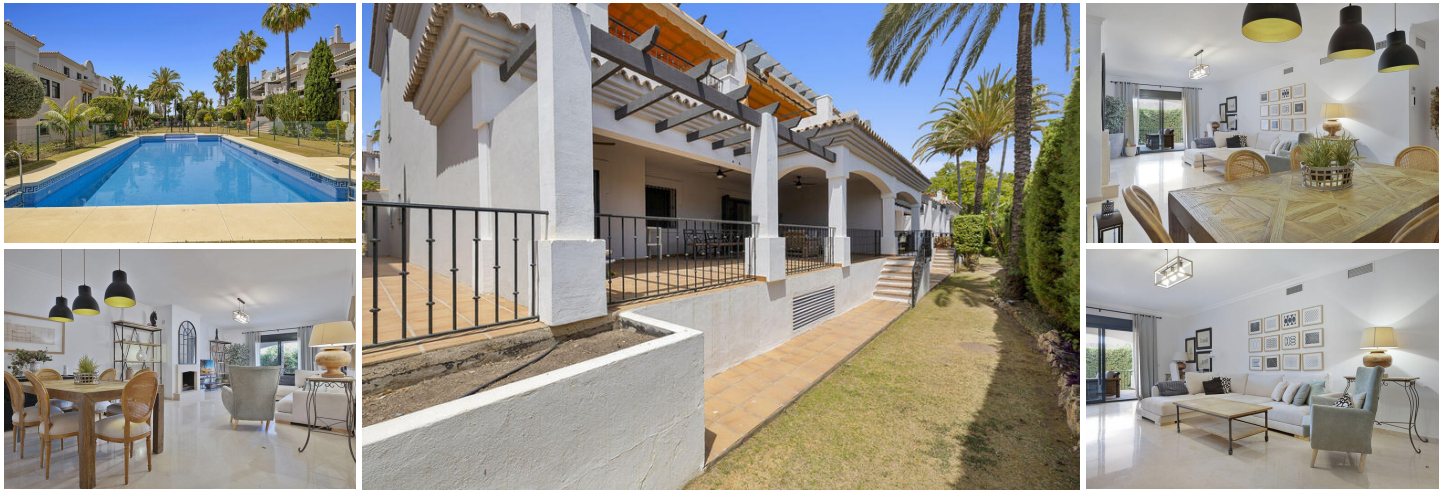
Ground floor apartment - San Pedro de Alcántara

Facing due south, here is a ground floor of 178m 2 surprising by its volumes and its privacy. Ideally located, you will be close to shops on foot but also to the beach (1 km) and the city center.