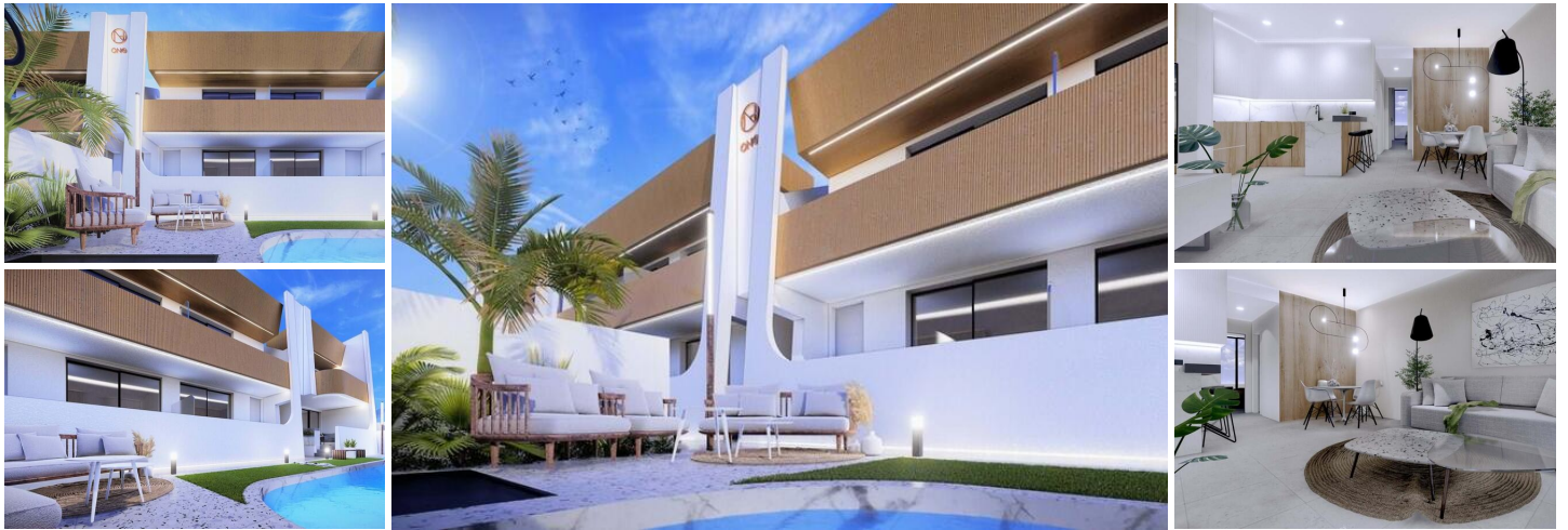
NEW BUILD RESIDENTIAL OF APARTMENTS IN LO PAGAN

New Build residential complex of apartments on the ground floor with large front terrace and rear patio or penthouse with front terrace and large private rooftop solarium with pergola and summer kitchen, located just 350 metres from the beach.