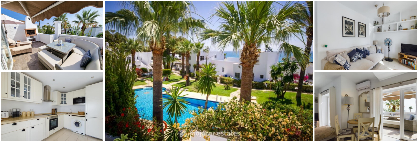
Stunning Beachfront Apartment for Sale in Mojacar Playa, Almeria

Welcome to a superb 2-bedroom apartment located in a highly sought-after first-line urbanisation on Mojacar Playa, Almeria. This stylish property boasts breathtaking views of the sea and lush communal gardens, featuring a tropical landscape with mature palm trees and expansive lawns. With direct beach access and a peaceful setting, this urbanisation is known for its exclusivity and charm, offering a fantastic investment opportunity as a holiday rental or permanent residence.