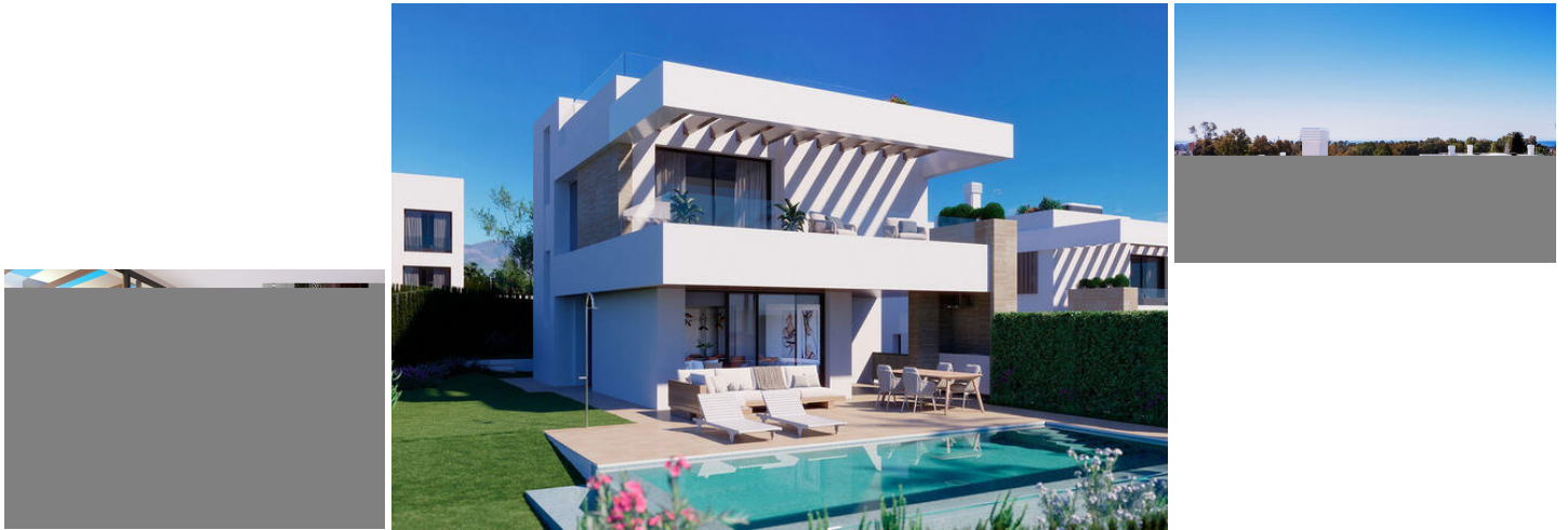
NEW GOLDEN MILE / ESTEPONA 3 Bedroom 3 Bathroom Villa

FREE Notary fees exclusively when you purchase a new property with MarBanus Estates