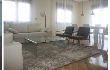
BEAUTIFUL VILLA IN LOS ALTOS, TORREVIEJA

Key Ready New villa in Los Altos located few minutes away from Hospital of Torrevieja and pink salt lake.