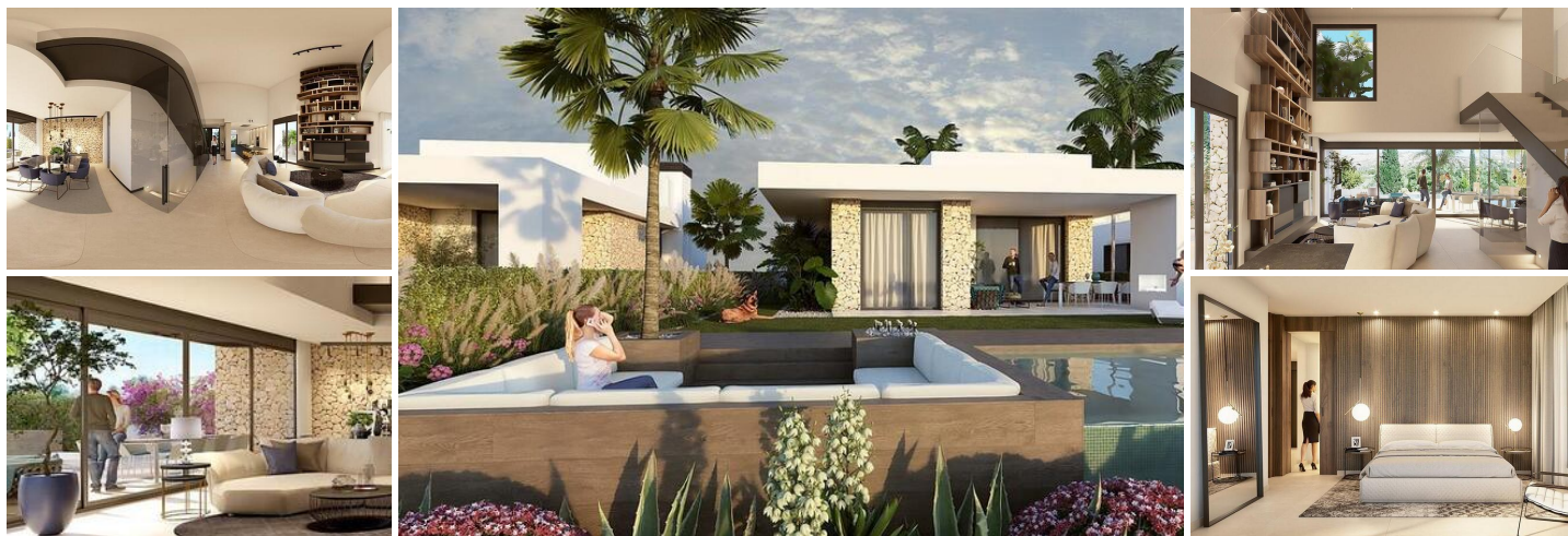
NEW BUILD LUXURY FIRST LINE VILLA IN ALGORFA GOLF COURSE

New Build first line golf one level villa in La Finca Golf resort.