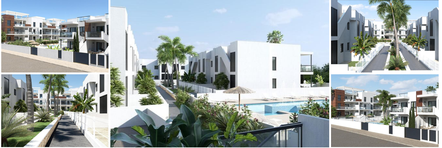
NEW BUILD RESIDENTIAL COMPLEX IN TORRE DE LA HORADADA

New Build residential complex of apartments, penthouses and bungalows with 2 and 3 bedrooms, 2 bathrooms in Torre de la Horadada only 300m from the beach.