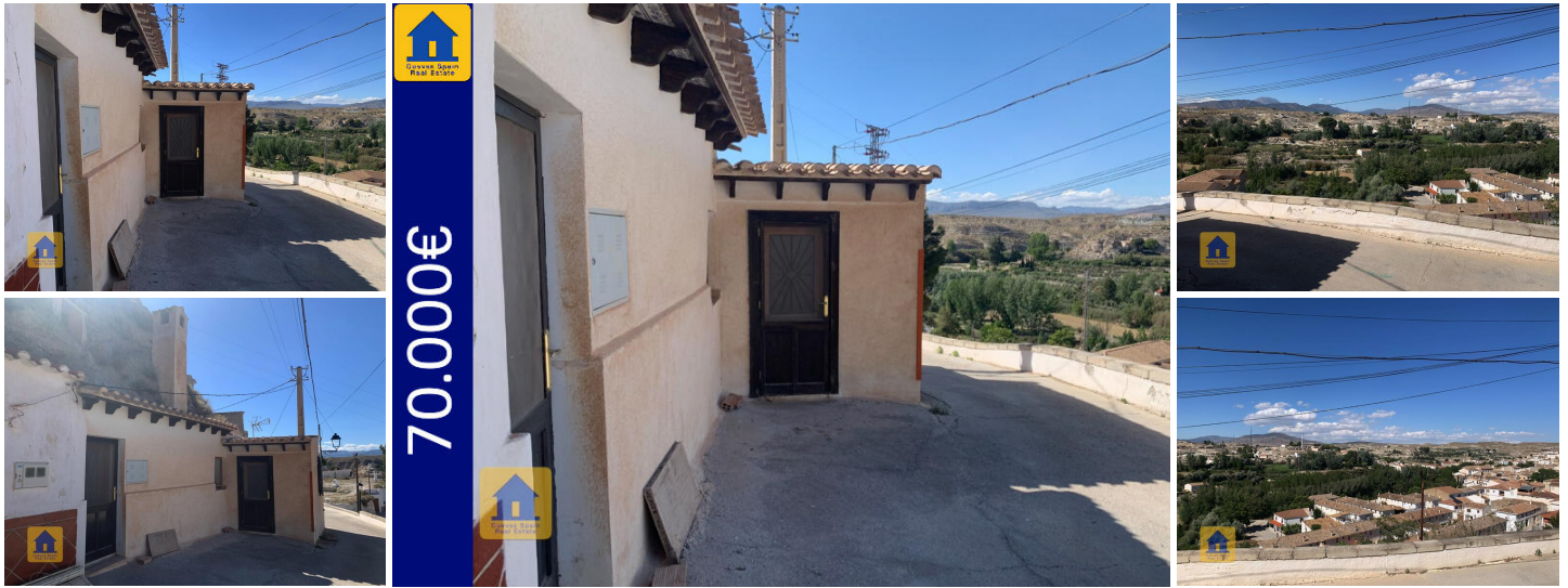
Cueva Serafin in Galera

This is a quirky, traditional, Spanish cave house with great views over the popular village of Galera! This property can be lived in right away or you could do some modernising to create a truly delightful home for holidays or full time living. Parking is at the front of the property. Amenities are a 5 min walk into the village.