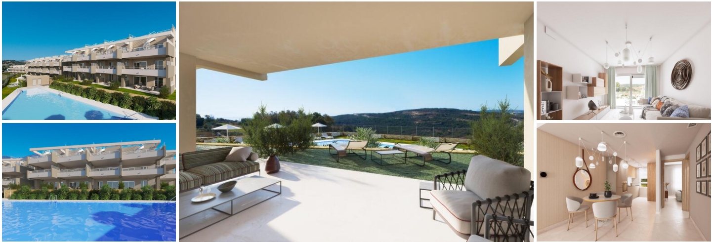
NEW BUILD RESIDENTIAL COMPLEX AT ESTEPONA GOLF

New development at Estepona Golf, at the heart of the Costa del Sol, with bright, spacious homes overlooking the golf course.