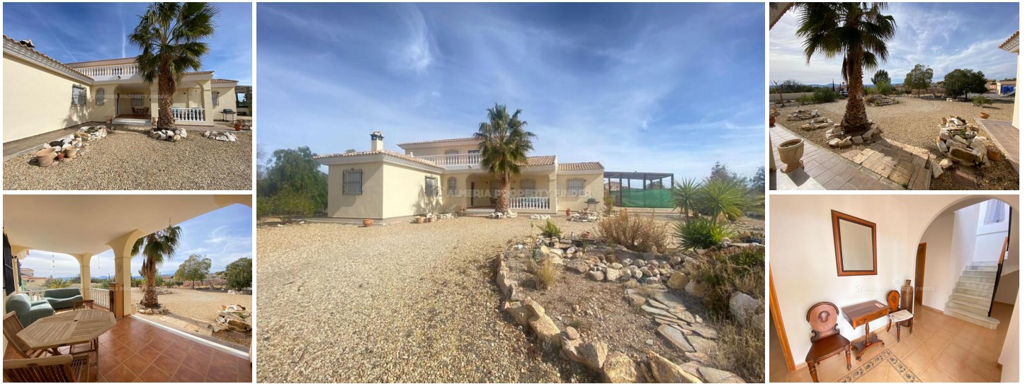
Villa Horti - A villa in the Albox area. (Resale)

This two-storey villa is located in Hortichuela, a few minutes' drive from Albox, where all amenities can be found: such as restaurants, bars, shops, banks, schools, medical center, etc. Around 40 minutes from the coast of Almería.