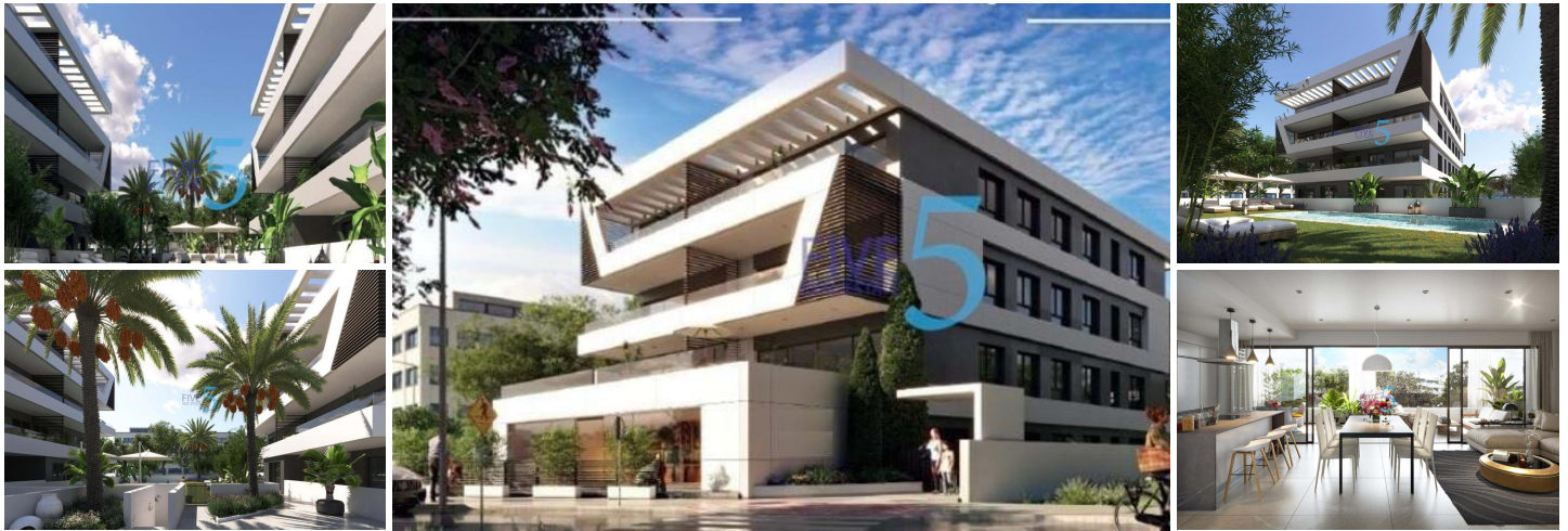
NEW BUILD RESIDENTIAL COMPLEX IN SAN JUAN DE ALICANTE

New Build residential complex of 32 modern apartments and penthouses located in the Nou Nazareth area in San Juan de Alicante.