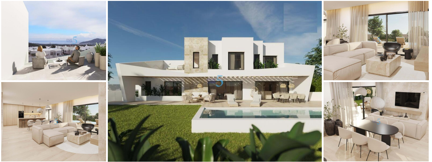
NEW BUILD VILLA IN POLOP

Modern New Build villa in Alberca, Polop with wonderful views to the mountain and the sea.