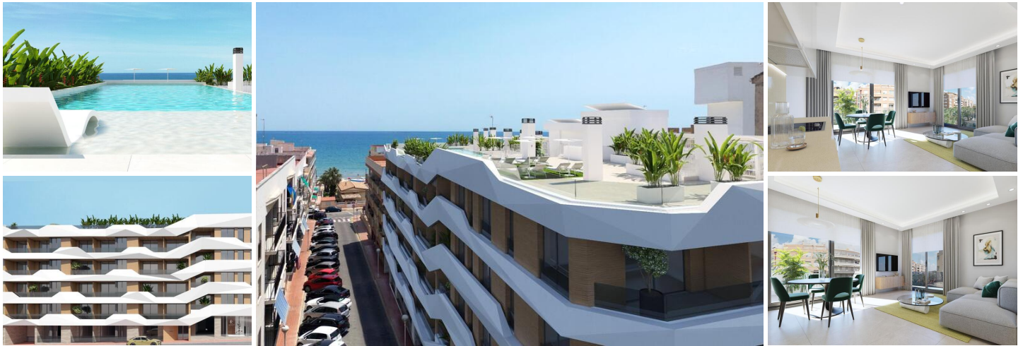
NEW BUILD RESIDENTIAL IN GUARDAMAR DEL SEGURA

New Build residential of apartments and penthouses in Guardamar del Segura.