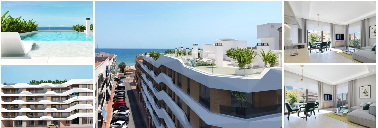
NEW BUILD RESIDENTIAL IN GUARDAMAR DEL SEGURA

New Build residential of apartments and penthouses in Guardamar del Segura.