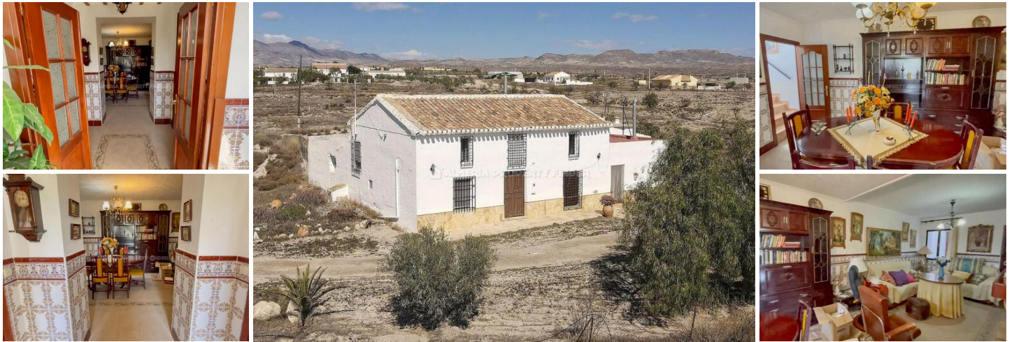
Cortijo Patricios - A country house in the Albox area. (Renovated)

An opportunity to purchase a cortijo and separate annexe with outbuildings having a total of 7 bedrooms, 3 bathrooms with excellent views located a few minutes from the market town of Albox which offers all amenities including a wide variety of shops, supermarkets, banks, post office, tapas bars, cafes, restaurants, 24 hour medical centre, sports facilities and two weekly markets.