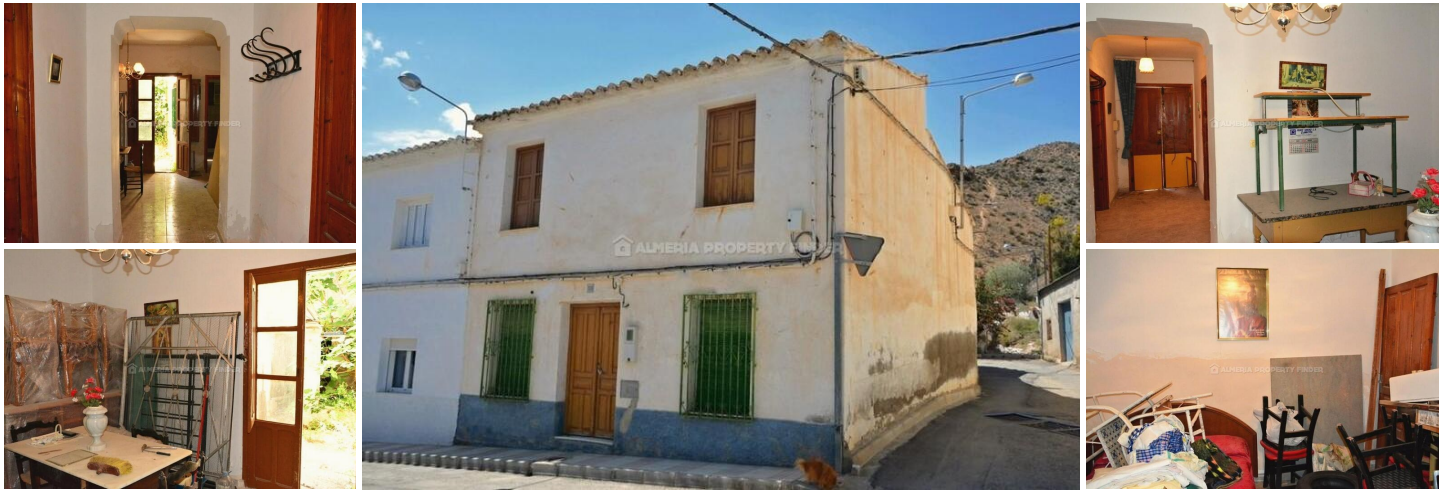
Casa Maleta - A town house in the Cantoria area. (For Renovation)

A 3 bedroom corner townhouse for restauration with a build of 144 m 2 , situated in the centre of the popular Spanish town of Cantoria. This lively traditional town offers a host of amenities on the doorstep and the chance to live the Spanish life! The larger towns of Albox and Olula del Rio are 10 minutes away, and there is excellent access to the motorway and road communications to the beaches and airports.