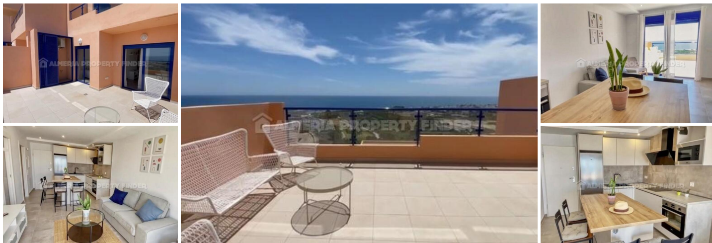
Apartment Mirador 1 - An apartment in the Mojácar Playa area. (Newly Built)