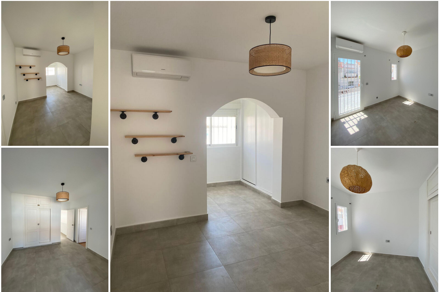
UNFURNISHED 3 BED TOWNHOUSE AVAILABLE FOR LONG TERM RENTAL

This beautiful townhouse is located in a charming Andalucian complex. With 3 bedrooms, it offers a comfortable and spacious living space. The ground floor features an open-concept layout with a living room, dining area, and kitchen. The cozy front terrace and south-facing backyard garden provide the perfect spots for relaxation. The property also boasts a communal pool and gardens, adding to the sense of community. The master bedroom comes with an ensuite bathroom, while the two additional bedrooms share a family bathroom.