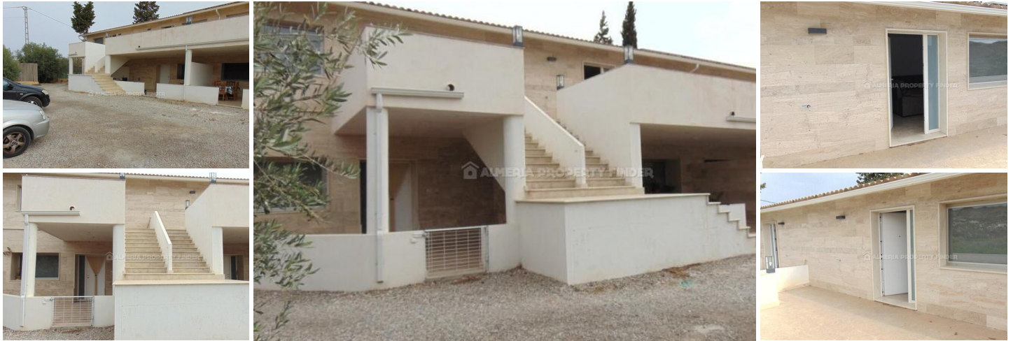
Apartment Fran 2 - An apartment in the Almanzora area. (Newly Built)