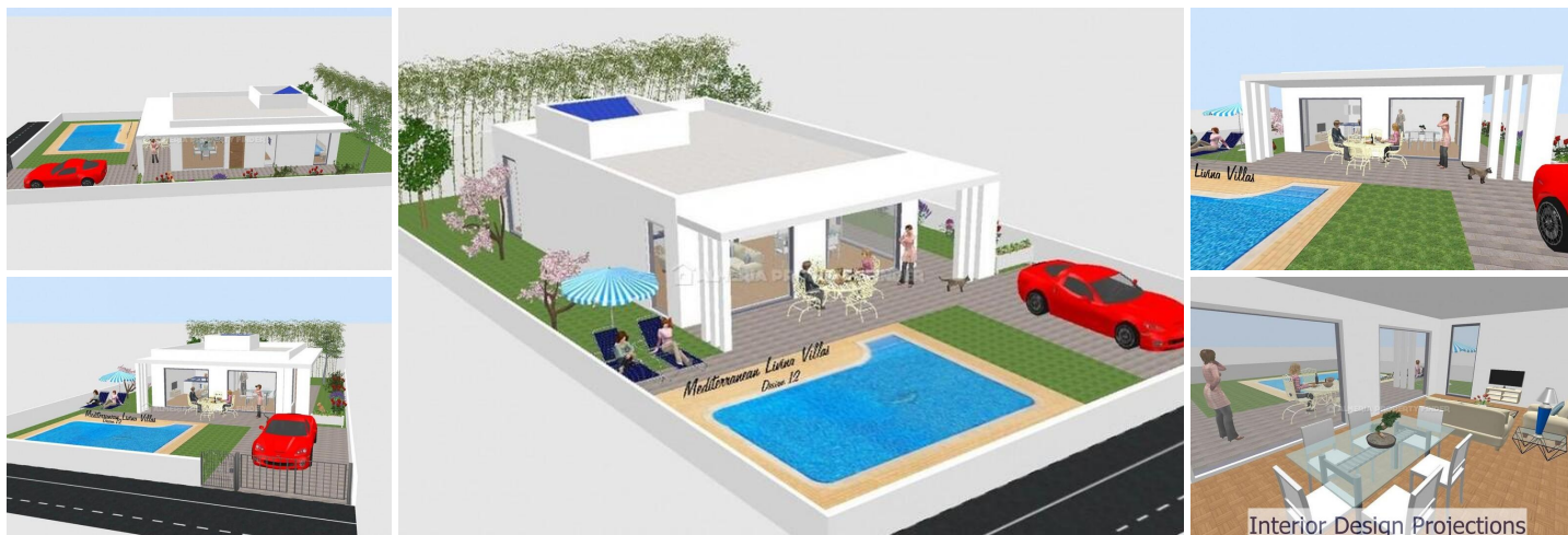
Villa Zentec 12 - A villa in the Mojácar Playa area. (Off Plan)