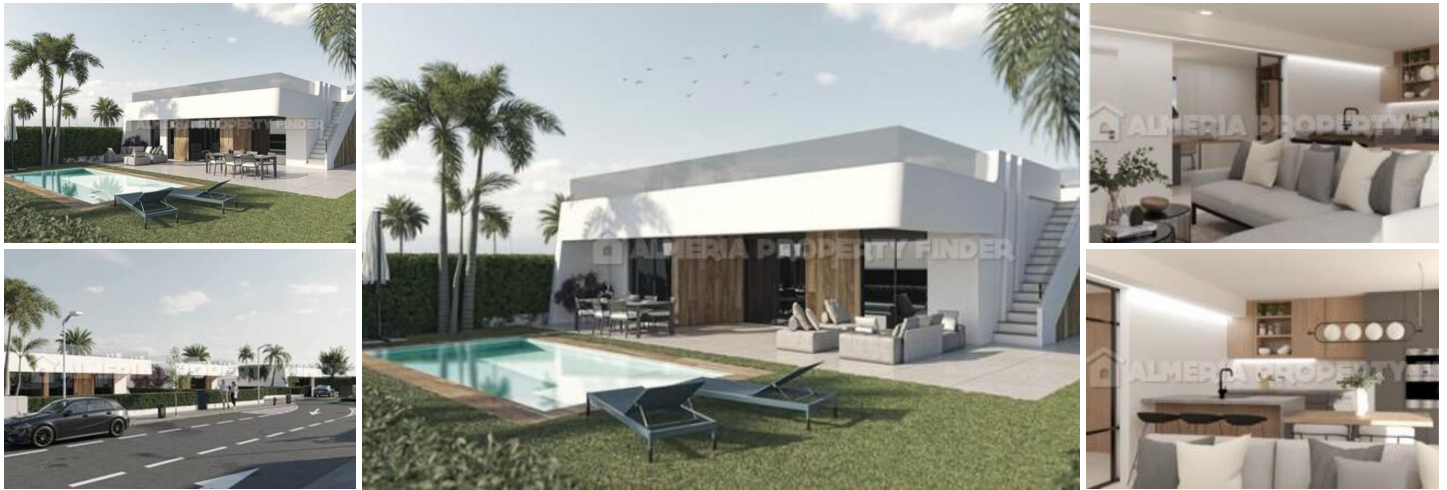
Atenea II Villa 6 - A villa in the Alhama de Murcia area. (Newly Built)

Alhama Nature Resort - Atenea II - Villa No. 6