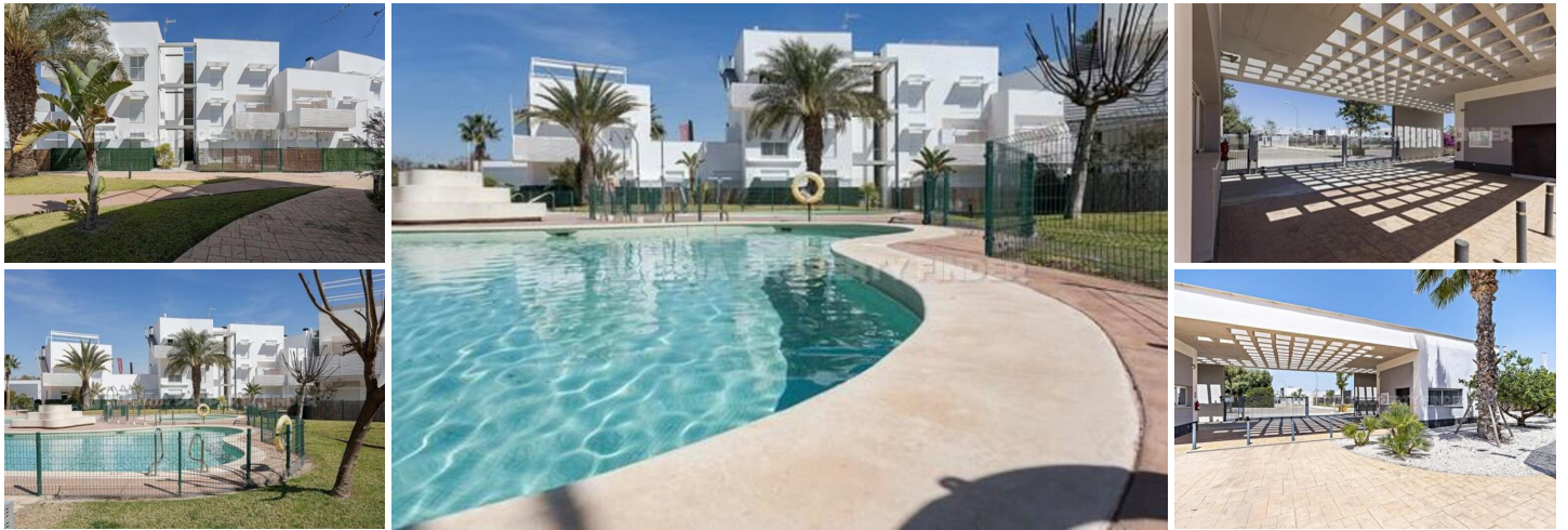
Puerta de Oriente BL2-PP1 - An apartment in the Vera Playa area. (Newly Built)

Groundfloor apartment with 3 bedrooms, 2 bathrooms, 114m 2 build and 62 m 2 outside space.