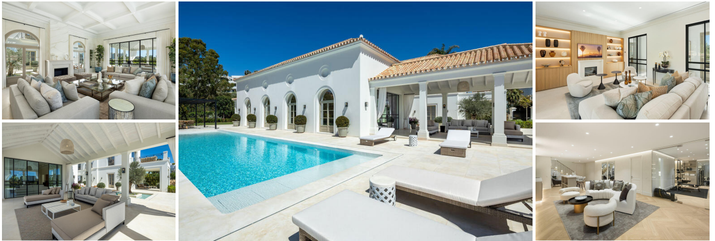
LA CERQUILLA / NUEVA ANDALUCIA

FREE Notary fees exclusively when you purchase a new property with MarBanus Estates