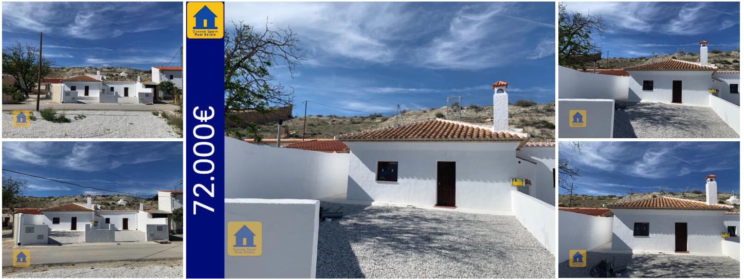
Cueva Mario 2 in Castilléjar

Superb, brand new cave house, situated on the outskirts of the peaceful, traditional village of Castilléjar, with views of the dramatic Badlands. The house is south facing and has a large front patio with ample space for parking. There is a spacious, open plan living/dining room, kitchen, a central hall and three bedrooms (one walk-through), bathroom, and a small room for a walk-in closet or an office. The kitchen is prepared for all the connections (to be furnished by the new owner). The central hall has a light well providing natural light deeper into the cave.