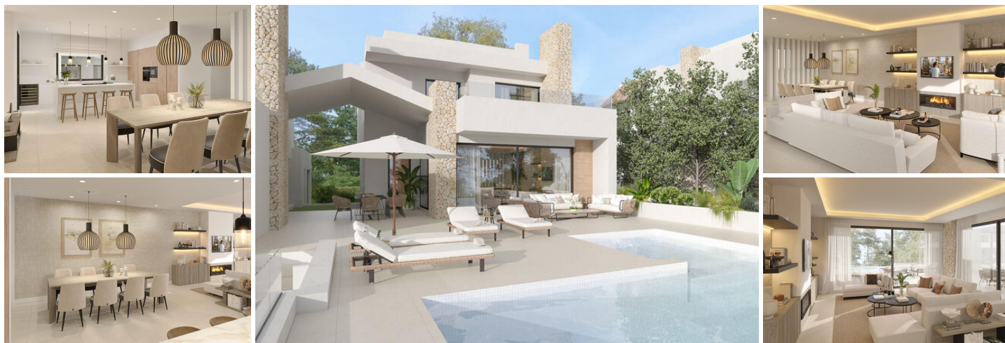
SAN PEDRO ALCANTARA .... VILLAS

FREE Notary fees exclusively when you purchase a new property with MarBanus Estates