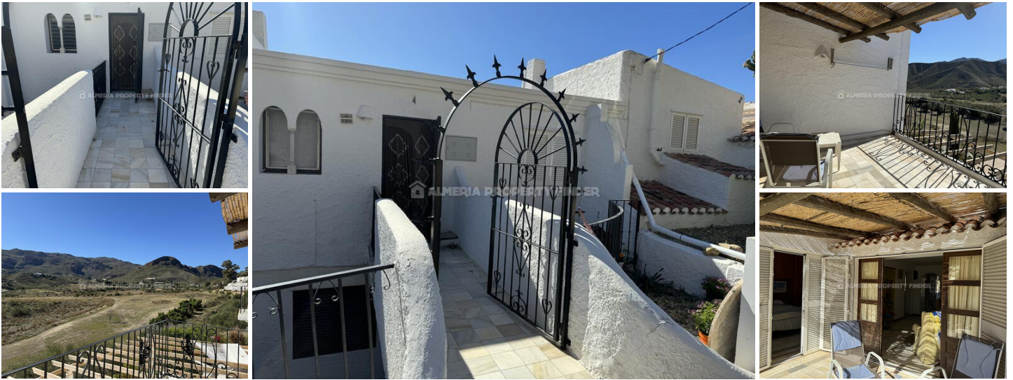
Apartment Euna - An apartment in the Cortijo Grande area. (Resale)

Mashariki, Cortijo Grande: For sale we offer a lovely apartment over-looking the old golf course and offering the most exquisite views of the mountains and the surrounding countryside. Located a short drive from the town of Turre the apartment provides peace and tranquility. It comprises hallway, fitted kitchen, living room with access to the spectacular terrace, master bedroom with glorious views, second bedroom and the bathroom.