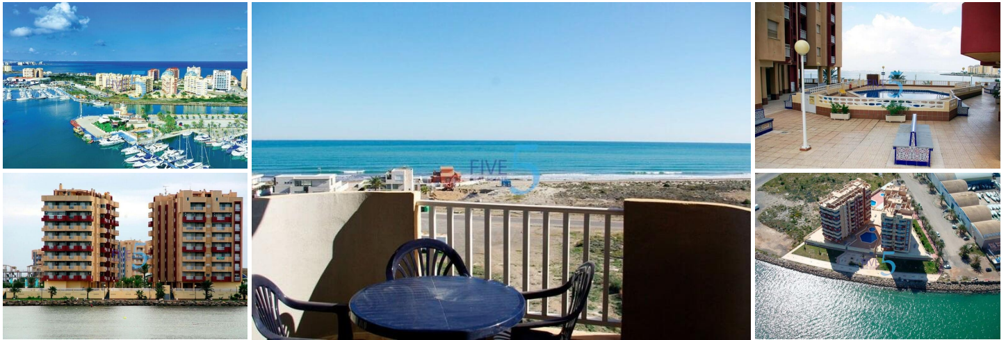
BEAUTIFUL SEA VIEW APARTMENTS IN LA MANGA

This urbanization is located in the area with the greatest projection of La Manga, next to Los Miradores del Puerto and the extension of the Tomás Maestre marina. In addition, the same area has all the necessary services, such as cafes, supermarkets, restaurants, a beach bar, pharmacies, etc.