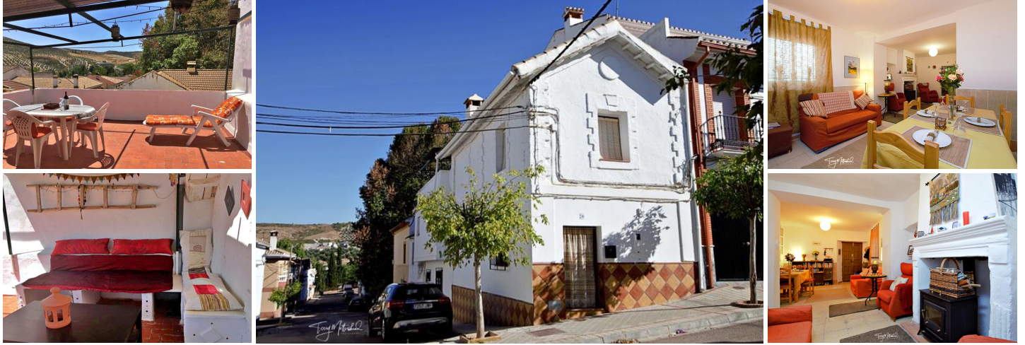
Traditional village house with roof terrace in convenient town centre location close to lake Bermejales.

Occupying a bright corner plot within the traditional andalusian town of Arenas del Rey this large family home offers 3 double bedrooms plus a large study (occasional fourth bedroom) off which is a large open sun terrace with great country views. On the ground floor there is a spacious lounge/dining room with feature fireplace and wood burning stove, a traditional kitchen and a family bathroom which is modern and fully tiled. The first floor provides a large double bedroom to the front of the property accessed by a small stairway which is bright and is double aspect and also off this stairway is the large study (fourth bedroom) which gives access to the large sun terrace which has country views and makes a great social space or quiet retreat. There are two further double bedrooms towards the rear of the property accessed by a separate stairway, both bright and one which is also dual aspect.