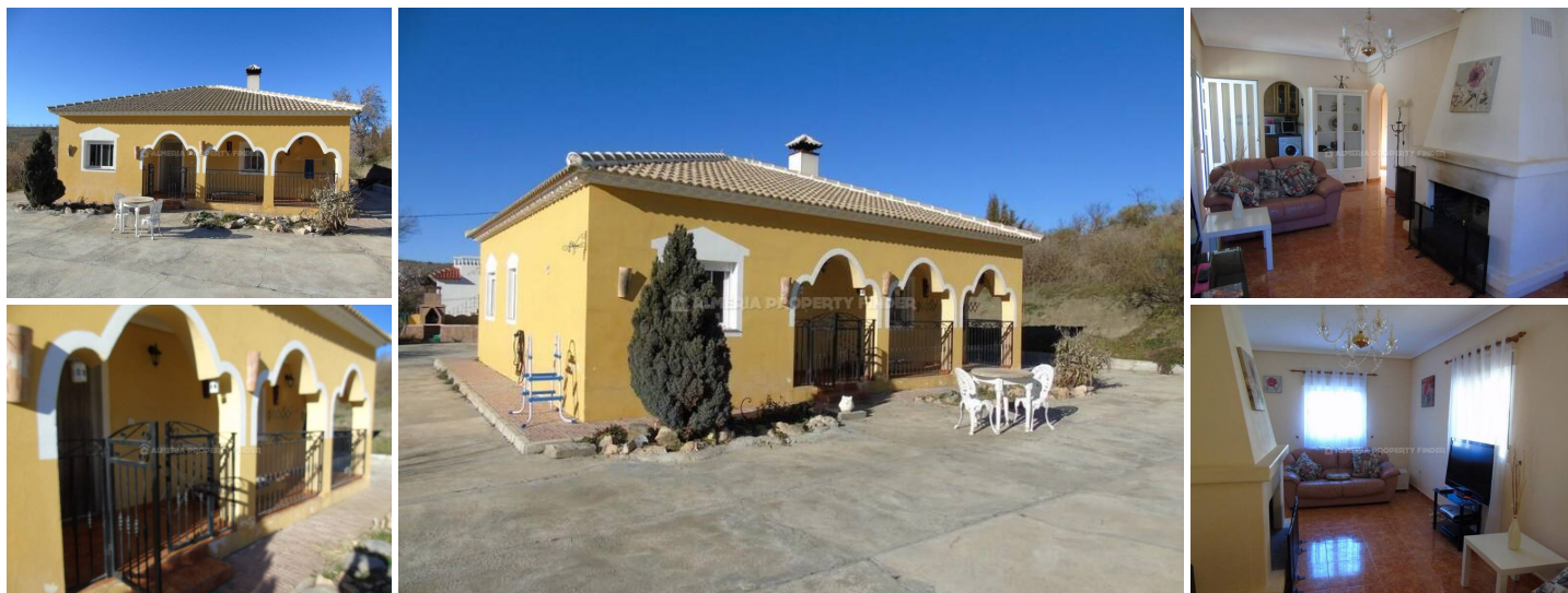
Villa Nevada - A villa in the Oria area. (Resale)

Detached 3 bedroom villa with guest chalet, set in a beautiful rural area with only two neighbours, just outside the sleepy hamlet of El Margen. The villa is only 3km from a village with bars / restaurants, and around 15 minutes drive from the towns of Oria and Chirivel which offer all amenities.