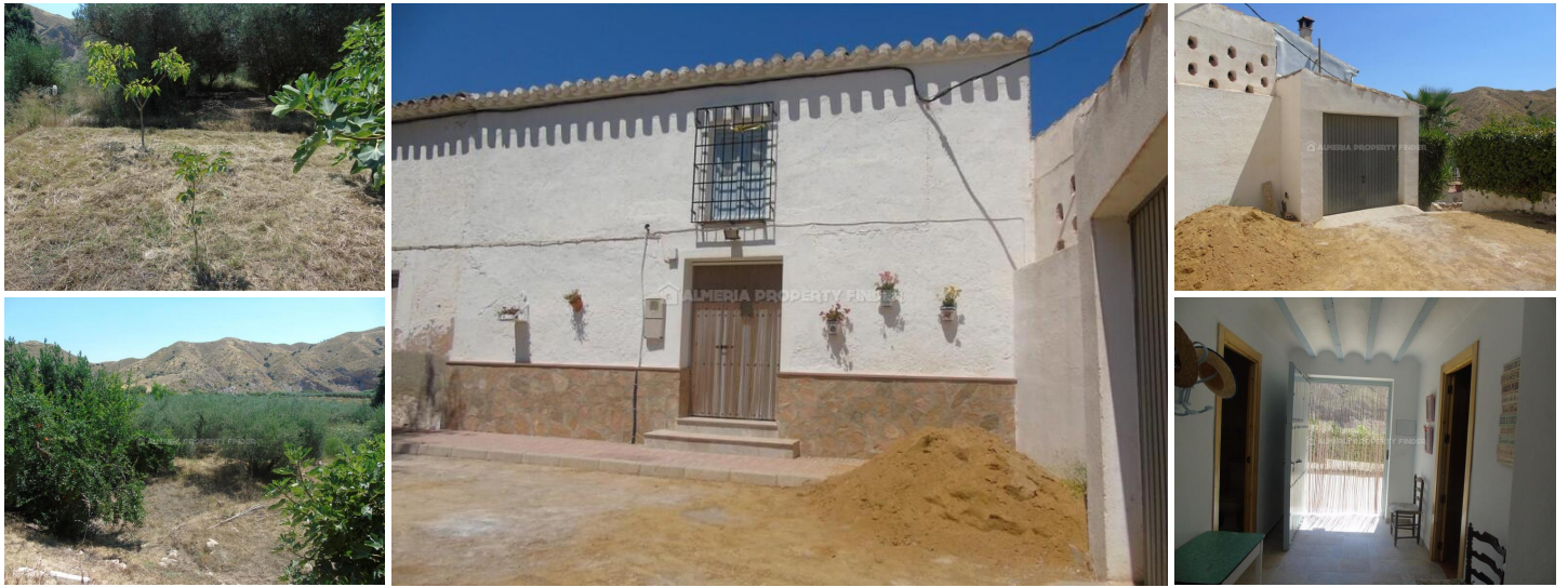
Cortijo Higuera - A country house in the Cantoria area. (Renovated)

A charming renovated traditional two storey property semi- detached 4 bedroom country house for sale in Almeria Province.