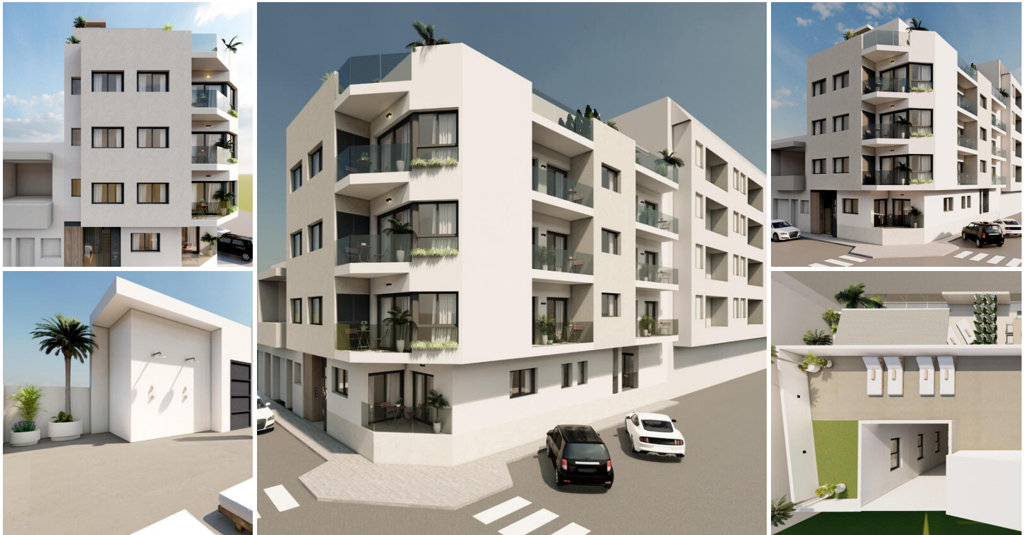
Modern New Build Apartments in Guardamar del Segura Near the Beach