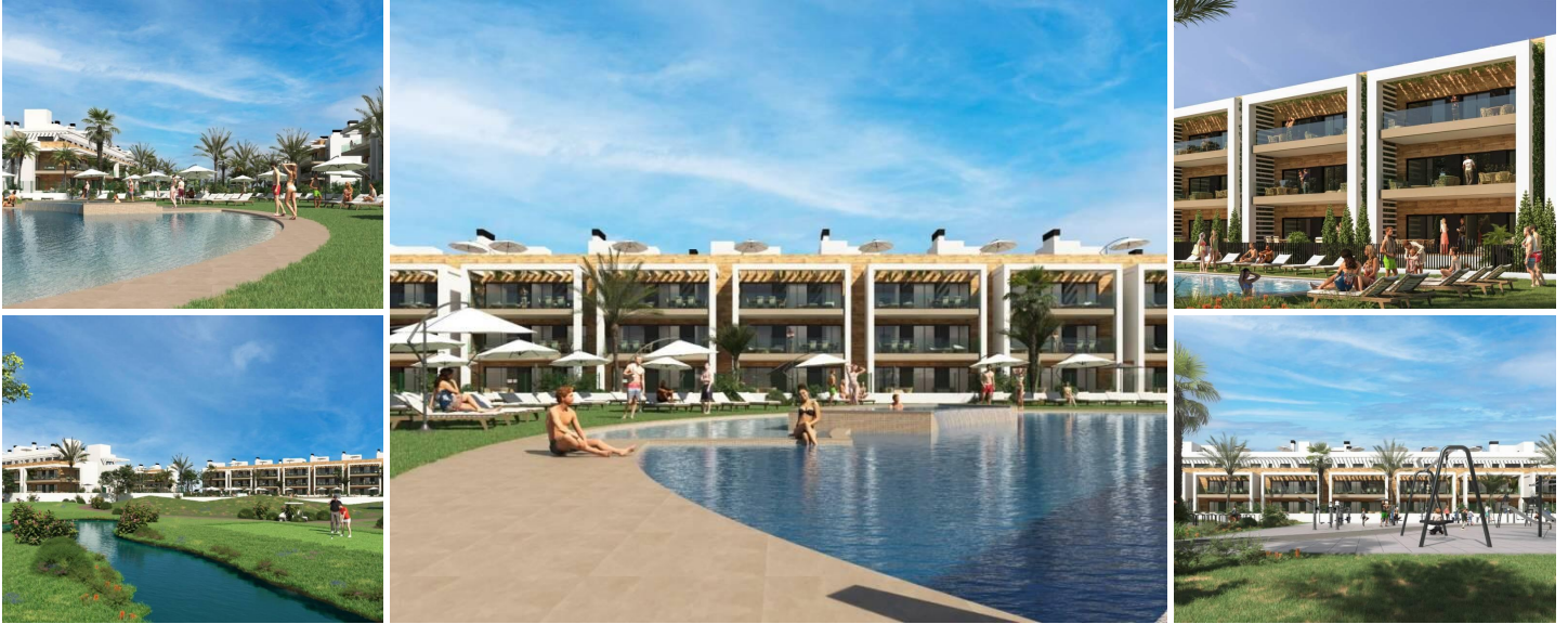
NEW BUILD RESIDENTIAL COMPLEX NEAR LA SERENA GOLF, LOS ALCAZARES

This amazing complex will be formed by 244 apartments with 2 and 3 bedrooms, divided in 8 blocks and 20 private Villas.