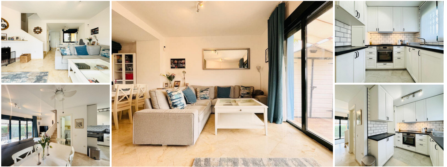
Semi detached house in La Duquesa

Welcome to Torres del Golf, a small, gated community with immaculate gardens, a swimming pool and allocated parking. Ideal for a family, this property offers plenty of indoor and outdoor space, access directly from the garden to the communal swimming pool, sunshine all day round and gorgeous mountain views. Situated just a few minute drive away from all local amenities and La Duquesa Marina, the property offers the perfect blend of tranquility and convenience.