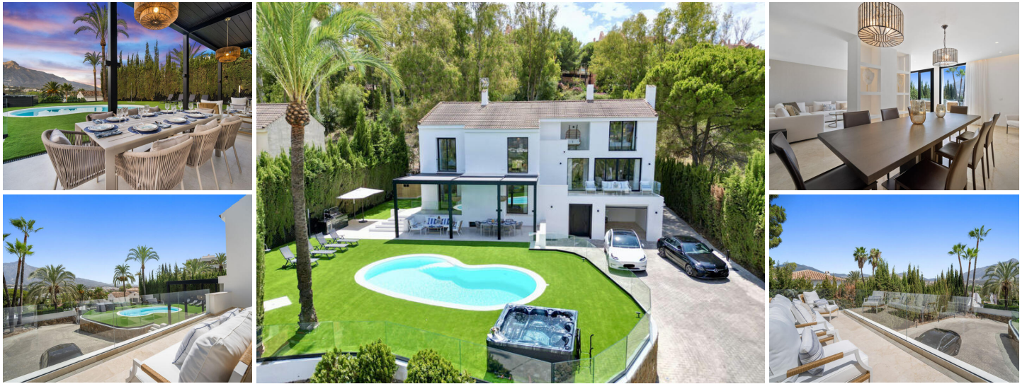
Spectacular new villa in Nueva Andalucia

New on the market 2023 stunning villa offers the following layout : 5 bedrooms / en-suite 5 bathrooms, 2 extra bathrooms, living room with extended open plan kitchen. Access to a south facing covered terrace.