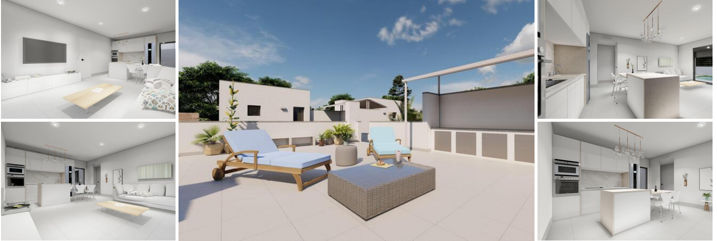
Semi-detached and Semi-detached Villas in Roldán, Murcia, Spain