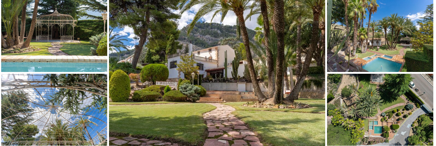
Spectacular Luxury Estate with Panoramic Views in Alcoy

We present a unique property located in one of the best areas of Alcoy, a city that perfectly combines tranquility with high-quality services. Just 50 minutes from the city of Alicante, Alcoy offers everything needed for a comfortable life: schools, pharmacies, a hospital, universities, and a rich cultural and commercial offering, all just minutes away.