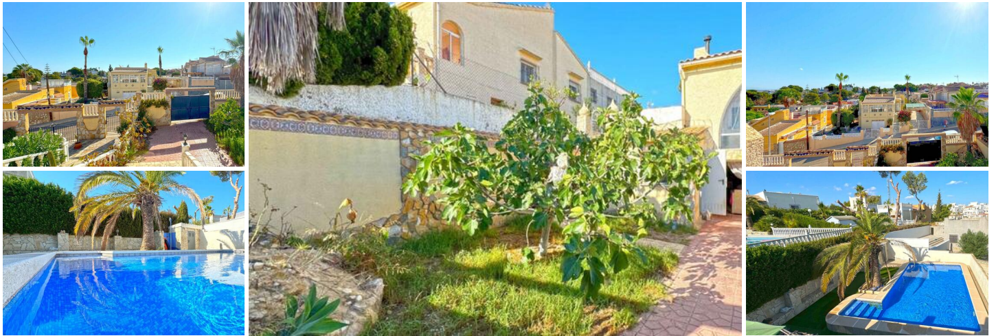
Charming Semi-Detached Villa in Los Balcones, Torrevieja – Your Dream Home Awaits!

Welcome to this delightful semi-detached villa nestled in the sought-after area of Los Balcones, Torrevieja. This property offers a unique blend of comfort, privacy, and potential, making it the perfect home for both permanent living or a serene holiday retreat.