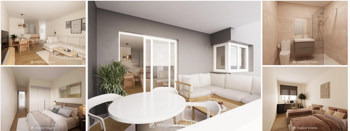
Terrazas del Levante: Modern 2 Bedroom Apartments 300m from the Beach in Aguilas, Murcia.

Discover Terrazas del Levante, a brand-new residential development in Águilas, just 300 metres from the beach. This exclusive community offers 2 and 3-bedroom apartments, each with spacious terraces, a private garage, and a storage room. Designed for modern comfort, these homes feature bright, open interiors and high-quality finishes, ensuring a perfect blend of style and functionality. Residents will enjoy a gated community with a large swimming pool, landscaped gardens, and a communal lounge—ideal for relaxation and socialising.