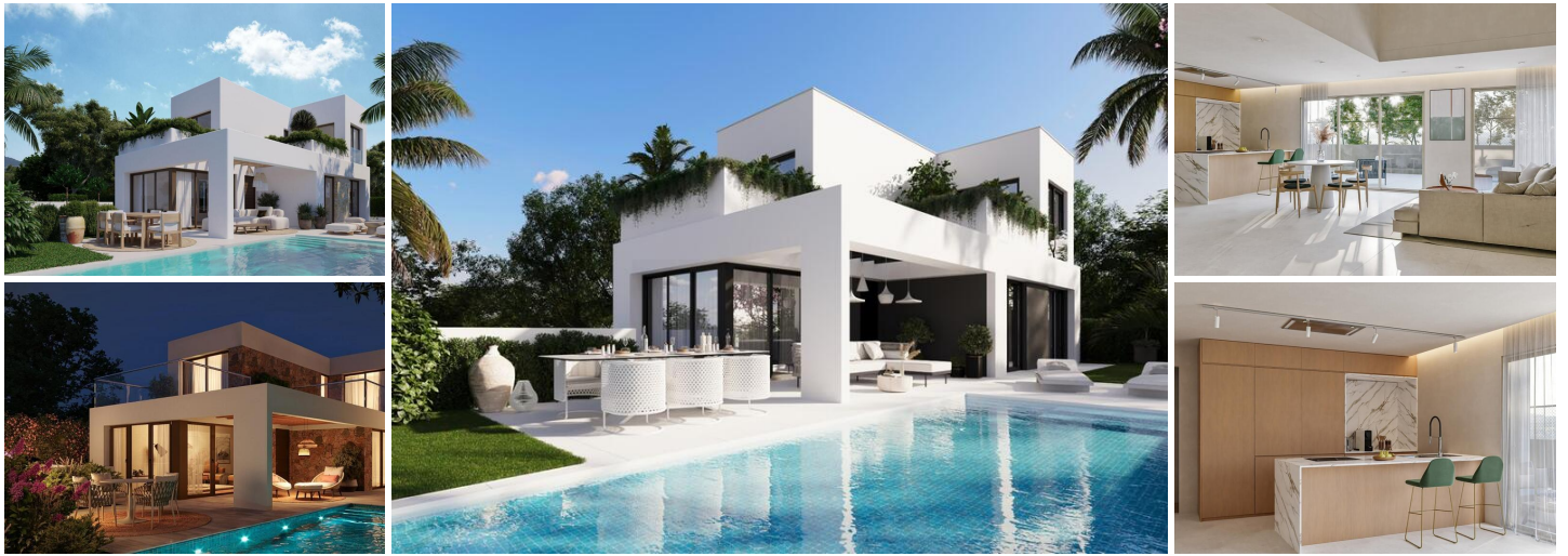
New Villas in Finestrat - Luxury, Nature and Sea Views