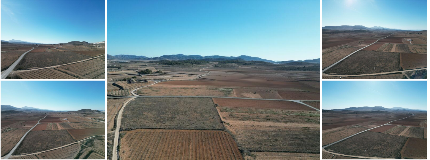
Spacious Plot Near Pinoso, with Possibility for Subdivision

Are you looking for a spacious plot of land in a peaceful rural setting, yet still within a short distance of amenities? This plot of 24,831 m 2 , located near the village of Cañada del Trigo and just an 8-minute drive from Pinoso, could be the ideal option. The location is perfect for those seeking tranquility and space, without being far from village amenities.