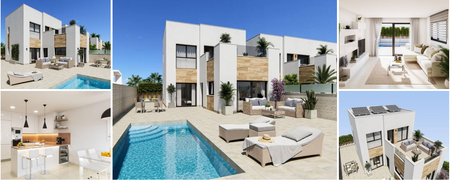
Modern New-Build Villas in Benijófar with Private Pools