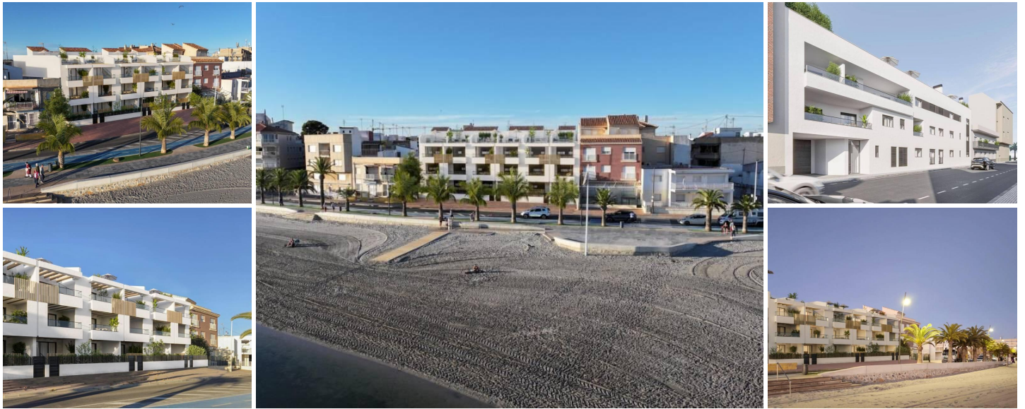
NEW BUILD FRONTLINE RESIDENTIAL IN SAN PEDRO DEL PINATAR

Nestled along the captivating Mar Menor, Lo Pagan is a town in Murcia that unveils a seamless blend of natural beauty and cultural richness, offering a perfect escape for those seeking a tranquil oasis.