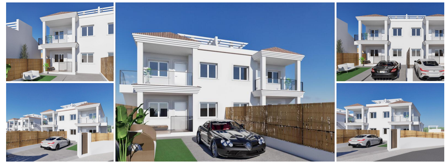
Discover Your Dream Home in Castalla: Villas and Apartments in a Serene Mountain Setting

A Unique Real Estate Opportunity in Castalla, Alicante